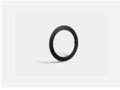
55-00001, B black ring for Ravo