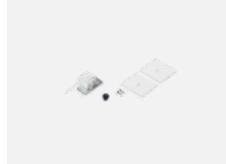
35-20101, S 2xend cap - metal, 5- conductor terminal box, grommet