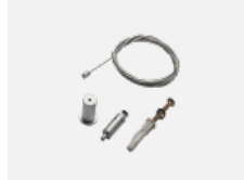
35-00300, N wire suspension 2000mm