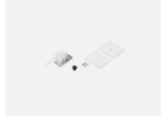
35-20101, W 2xend cap - metal, 5- conductor terminal box, grommet