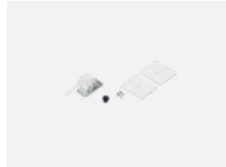
35-20101, W 2xend cap - metal, 5- conductor terminal box, grommet