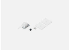
35-20101, W 2xend cap - metal, 5- conductor terminal box, grommet