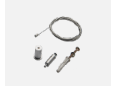
35-00300, N wire suspension 2000mm