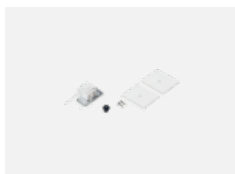
35-20101, B 2xend cap - metal, 5- conductor terminal box, grommet