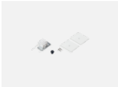
35-20101, W 2xend cap - metal, 5- conductor terminal box, grommet