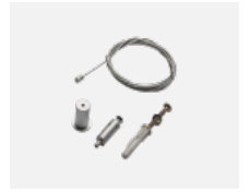
35-00300, N wire suspension 2000mm