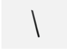
00-00350, B cable 3x0,75 1000mm, black