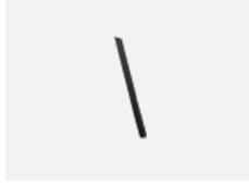
00-00352, B cable 3x0,75 2000mm, black