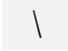
00-00360, B cable 3x0,75 6000mm, black