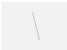
00-00355, W cable 5x0,75 2000mm, white