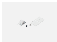
35-20101, W 2xend cap - metal, 5- conductor terminal box, grommet