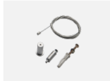
35-00300, N wire suspension 2000mm