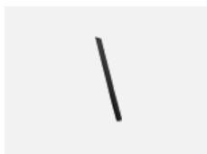
00-00352, B cable 3x0,75 2000mm, black