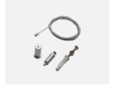
35-00300, N wire suspension 2000mm