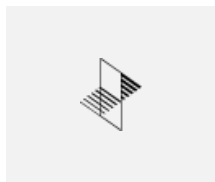
35-00101, B 2x recessed end cap - metal, 5-conductor terminal box, grommet