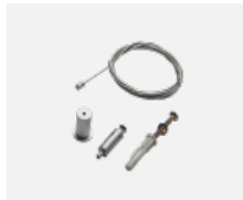
35-00300, N wire suspension 2000mm