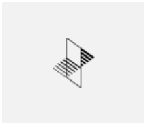
35-00111, W 2x recessed end cap long - metal, 5- conductor terminal box, grommet