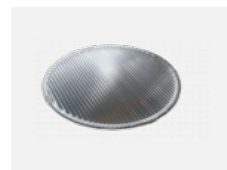
00-01101 Linear optic