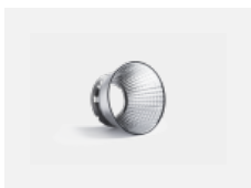
00-01002 reflector 32°