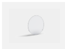
00-01100 Satinice diffuser