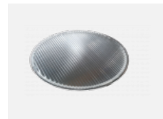
00-01101 Linear optic