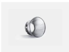
00-01002 reflector 32°