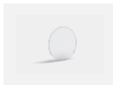
00-01100 Satinice diffuser