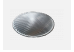
00-01101 Linear optic