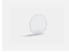
00-01100 Satinice diffuser