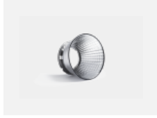
00-01002 reflector 32°