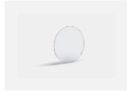
00-01100 Satinice diffuser