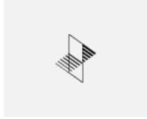
228-20101, W 2 end caps