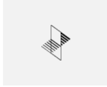
228-20200, N arranging coupler