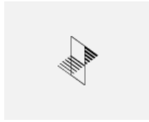
228-20200, N arranging coupler