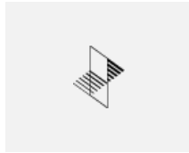
228-20200, N arranging coupler