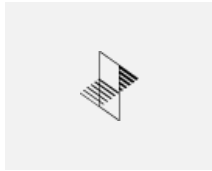
228-20101, B 2 end caps