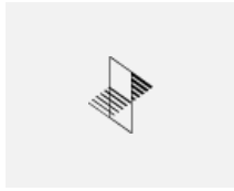
228-20101, W 2 end caps