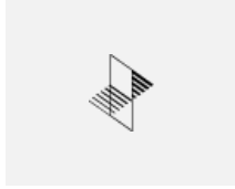
228-20101, S 2 end caps