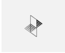
228-20101, B 2 end caps