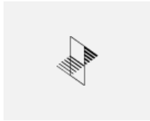
228-20101, W 2 end caps