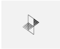
228-20101, S 2 end caps