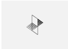
228-20101, S 2 end caps