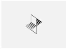
228-20101, W 2 end caps