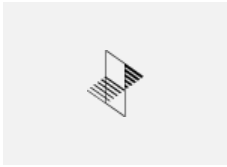
228-20101, B 2 end caps