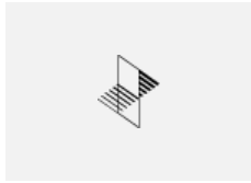
228-20200, N arranging coupler