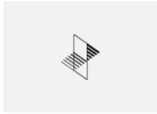
228-20101, S 2 end caps