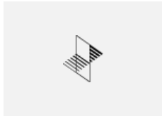
228-20200, N arranging coupler