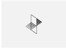
228-20200, N arranging coupler