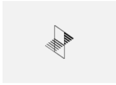
228-20101, S 2 end caps