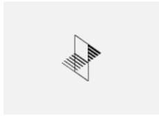
228-20101, W 2 end caps