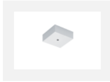
00-00370, B ceiling cup 80x80x32mm