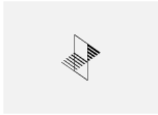
228-20101, B 2 end caps