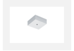
00-00370, W ceiling cup 80x80x32mm