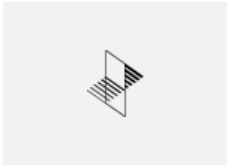
228-20101, W 2 end caps