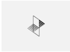
228-20200, N arranging coupler