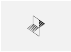
228-20101, S 2 end caps