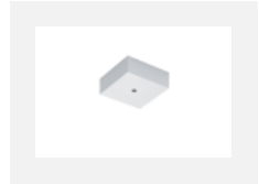
00-00370, W ceiling cup 80x80x32mm