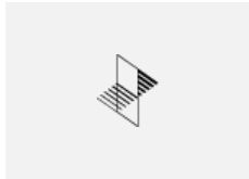
228-20101, B 2 end caps