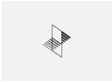
228-20200, N arranging coupler