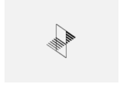
228-20101, W 2 end caps