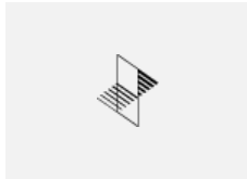
228-20200, N arranging coupler