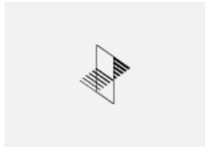
228-20101, W 2 end caps