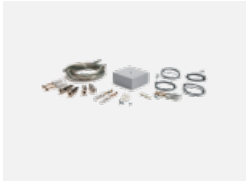
00-00333, W suspension set 2000mm, 4 pcs.of wires, cable 5x0,75mm, ceiling cup