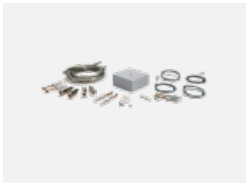
00-00333, W suspension set 2000mm, 4 pcs.of wires, cable 5x0,75mm, ceiling cup