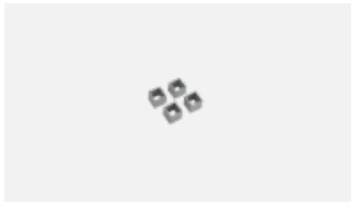
19-0009, W Mounting distance kit for square luminaire, circular 370 mm