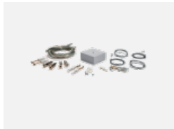
00-00333, W suspension set 2000mm, 4 pcs.of wires, cable 5x0,75mm, ceiling cup