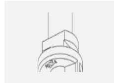
XTAK142-2, black Hook Base, black