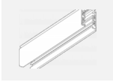
XTS4100-3, white linear track 1m, white