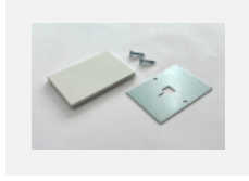
145-50102, S 2 x end cap - metal, screwless